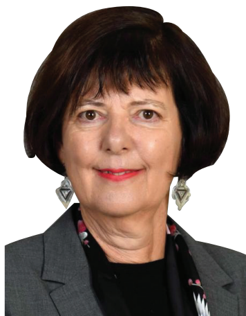
Ms Barbara Creecy, MP

Minister of Forestry, Fisheries and the Environment