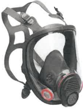
3M 6800 Reusable Full Face Mask