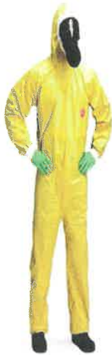
Tychem 2000C Chemical Suit