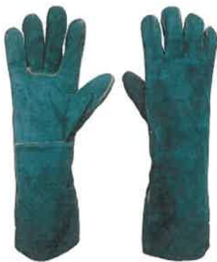
Heat Resistant Leather Green Braai Gloves/Welding Gloves By Great Empire