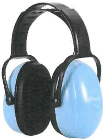
Noise Reduction Earmuffs For Occupational Work And Industrial Use: Professional Racket Drum