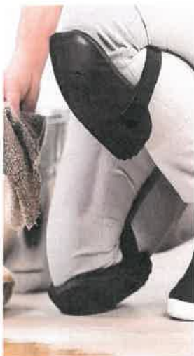
Industrial Knee Pads With Built-in Knee Protection, Durable, Soft And Sturdy