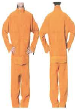
1 Set Leather Protective Apparel Workplace Clothes Welder Flame Welding Clothing Electric Welding Suit Jacket Coat+Trousers Suit Pure Leather Protective Retardant With Liner Safety