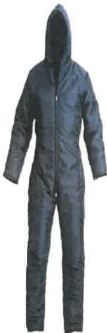
One Piece Freezer Suit