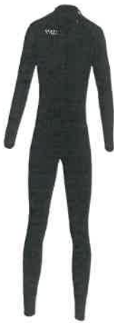
Full Body Men Black