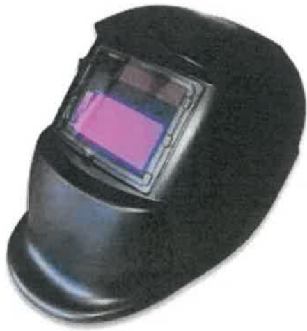
Auto Welding Helmet