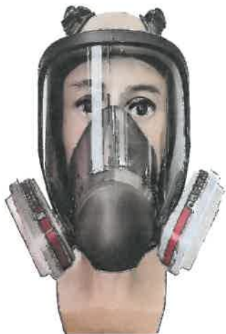
Evago 6800 Gas Mask Fire Spray Chemical Anti-formaldehyde Full Face Mask