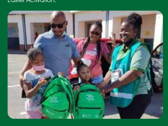
Above: Our DFFE team at Shell Ultra City in Midrand were hard at work ensuring that all travellers including the children took home with them the Good Green Deeds message.