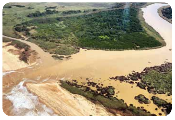
Above: Floodwaters have opened the Mouth of Lake St Lucia.