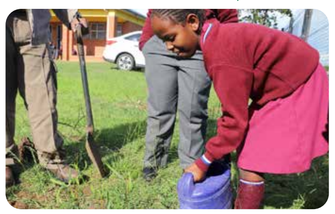
Above: Luthando Luvuyo Special School's pupil waters her tree after planting it at her school. Learners were instructed to look after their trees and ensure that their trees are well taken care of.

"We need to plant trees because trees are important for the environment and trees give us oxygen and provide habitat for the world's wildlife. As such, trees