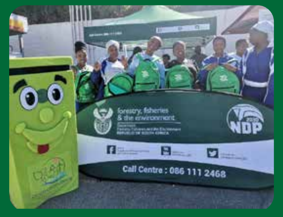
Above: Members of The United Zionist Apostolic Church participating in the DFFE Green Easter weekend campaign at the Shell Ultra City in Knysna.