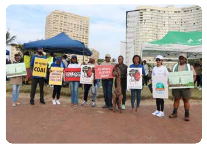
Above: Head of United Nations Environment Programme: South African Sub-regional Office, Dr Meseret Zemedkun with some representatives from different eThekwini Metropolitan Municipality community organisations at the march held from South Bearch to Blue Lagoon Beach.

World Environment Day is UNEP's biggest annual event commemorated on 5 June, with an aim of galvanising positive environmental action, It was adopted by the United Nations General Assembly in December 1972, and was first celebrated in 1974 with a view to deepening environmental awareness and address concerns such as the depletion of the ozone layer, toxic chemicals, desertification and global warming. South Africa has adopted the entire month of June to heighten awareness of environmental issues through various pertinent activities.