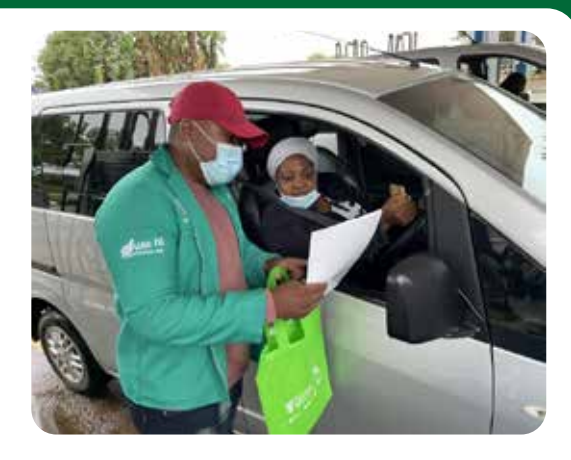
Above: DFFE employees at the Sasol garage in Zebediela in Limpopo.