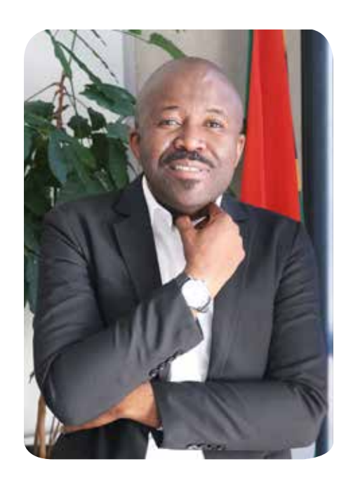
Dear Valued Stakeholder.

It is an honour to welcome you to the first edition of Environment Quarterly in the financial year 2022/23. With all restrictions of the National State of Disaster having been lifted, life is starting to get back to normal and as government, we still urge people to get vaccinated as the first line of defence against the Corona Virus.