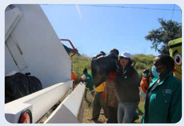
Above: Minister Creecy led a clean-up campaign with the newly launched fleet in the Mulenzhe village.

Minister Creecy launched the yellow fleet it in the Mulenzhe village in the Collins Chabane Local Municipality, Limpopo where she also handed over a compactor truck and a skip loader, which are both valued at more than R5 million to assist in waste collection and the processing of waste at landfill in the municipality.