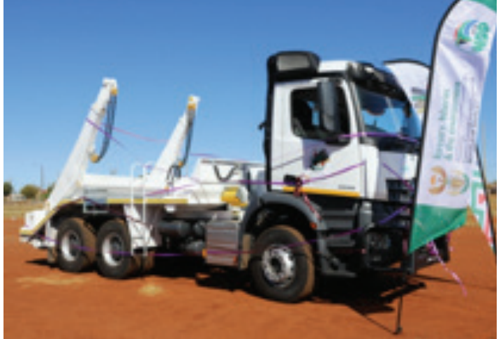
Above: Municipalities are struggling to provide regular and consistent waste collection services. Once dumpsites