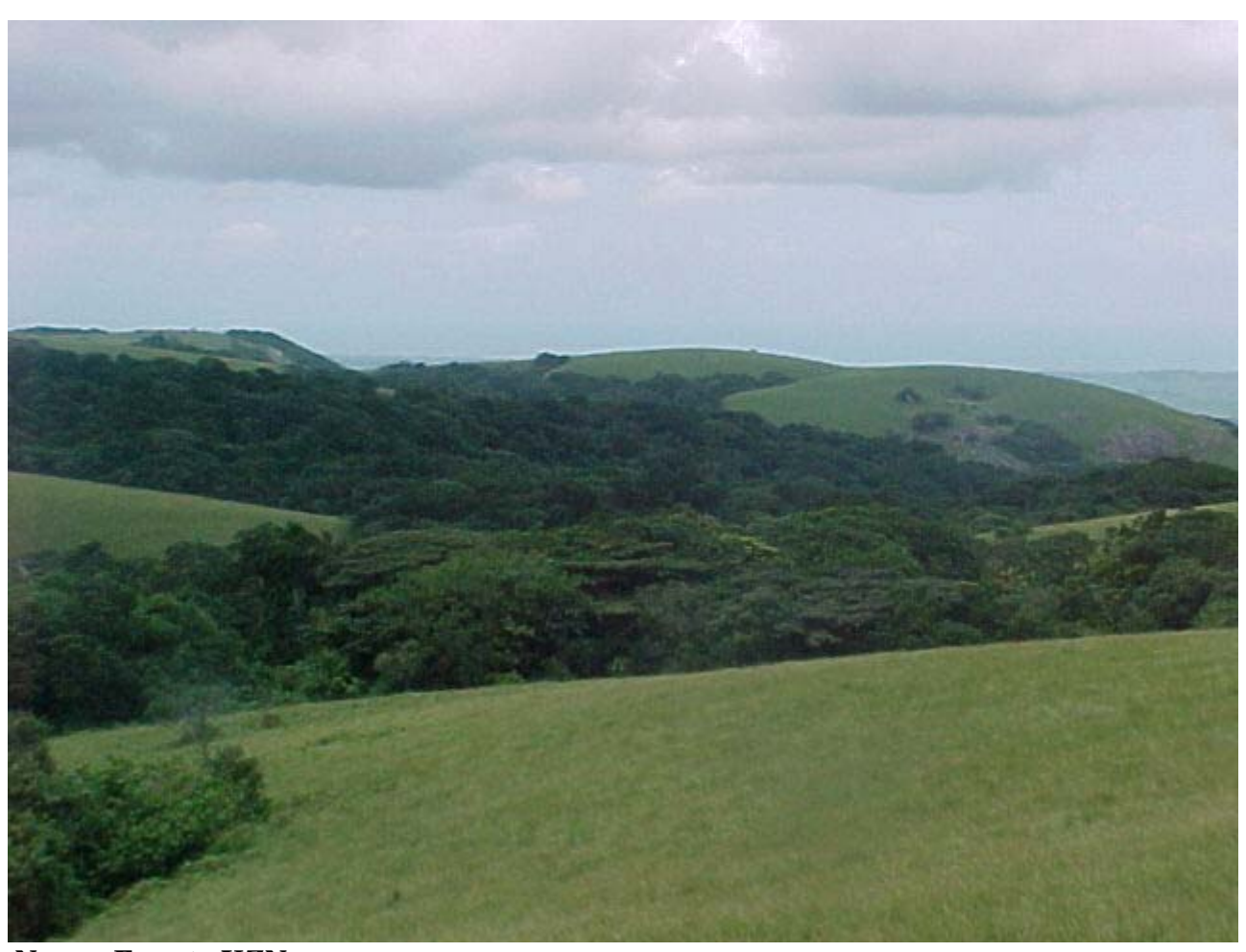
Ngoya Forest KZN