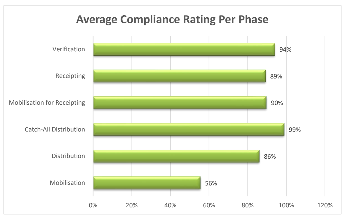
Figure 2-1: Compliance Per Phase

This subsection presents a summary of the observer data for the various project phases and regions.