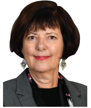
Ms Barbara Creecy, MP Minister of Forestry, Fisheries and the Environment FOREWORD BY THE MINISTER

It is a pleasure to present the Department of Forestry, Fisheries and the Environment's 2023/24 Annual Performance Plan which indicates our effort to not only be more innovative in the implementation of programmes, but also addresses the global environment threats facing South Africa.