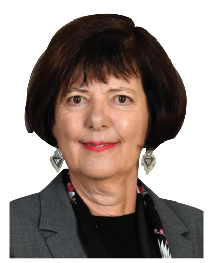
Ms Barbara Creecy, MP Minister of Forestry, Fisheries and the Environment