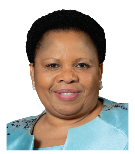
Ms Maggie Sotyu, MP Deputy Minister of Forestry, Fisheries and the Environment