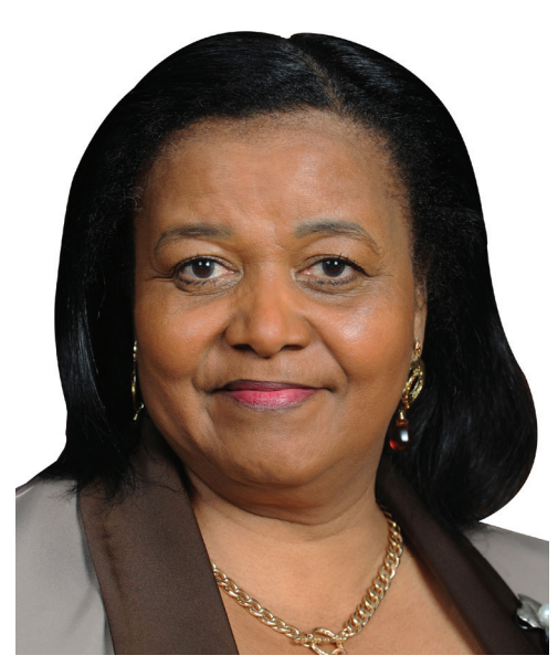
DR BOMO EDITH EDNA MOLEWA, MP MINISTER OF ENVIRONMENTAL AFFAIRS

The findings of various South African Environment Outlook Reports indicate that the overall condition of South Africa's environment continues to deteriorate. It is this deterioration that the Department of Environmental Affairs, through our programmes, is working hard to halt and, possibly, reverse.