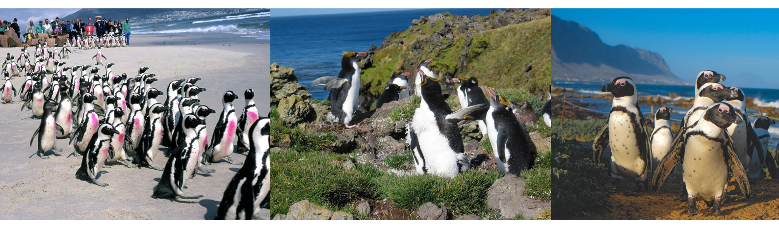
Above: Competition for food is thought to be one among a set of pressures that are contributing to the decline of the African Penguin population.

n a race to conserve the dwindling African Penguin population, the Minister of Forestry, Fisheries and the Environment, Ms Barbara Creecy has announced a 10-year ban on fishing near the African Penguin colonies.