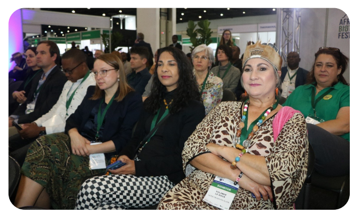
Above: Stakeholders that attended the ABF included investors, researchers, buyers and innovators from the food, fragrance, flavours, ingredients, and cosmetics sectors.