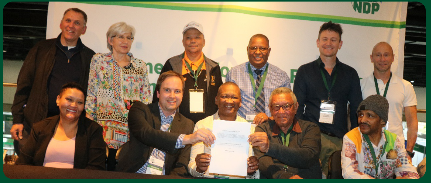
Above: It was all smiles at the signing of the Buchu Agreement by the National Khoisan Council, the South African San Council and the Buchu industry.

istory was made at the first African Biotrade Festival (ABF) when the Buchu Agreement was signed by the National Khoisan Council, South African San Council and the Buchu industry at the Sandton Convention Centre. This gives the councils a legal right to a fair share of the benefits that result from the profitable development of the buchu plant.