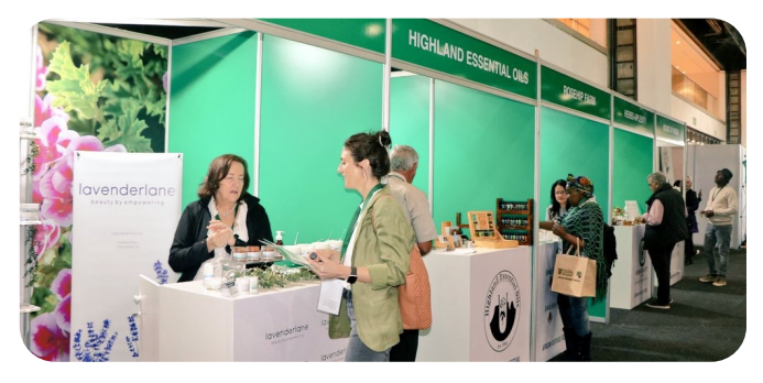
Above: The AFB showcased Africa's biodiversity endowment and indigenous plant resources. It created an enabling environment for buyers, SMMEs and communities.

Above: The African Biotrade Festival promoted networking amongst investors and innovators with an emphasis on market access, building business support networks, and linkages within the biotrade ecosystem.