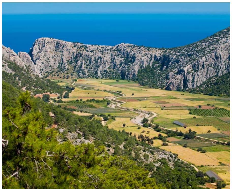
Agricultural farmland and countryside, Turkey

On the other hand, Brazil and Colombia have more abundant (though spatially uneven) natural endowments of water, energy and food resources. This provides opportunities to support livelihoods and development goals, rather than requiring sharp trade-offs in resource allocation. Managing climate variability and extreme events in these countries needs flexible institutional mechanisms, robust infrastructure and functioning natural systems for disaster risk management and to ensure resilience.