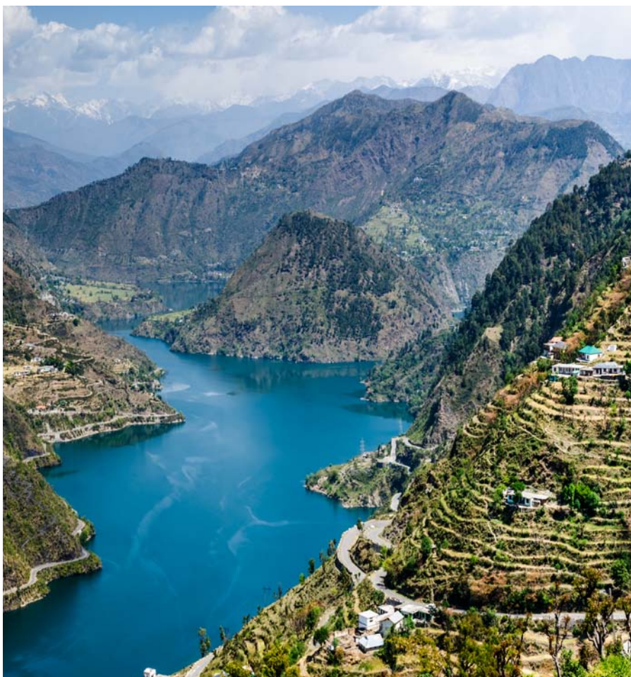
46kms long Tehri Lake filling up after the construction of the New Tehri hydro electric project dam on the River Ganga in Tehri Garhwal Chamba, India

The multiple benefits of regulatory and market instruments that promote resource-use efficiency include a resilience dividend. Achieving greater resource productivity can clearly have a direct developmental benefit, with better outcomes achieved for a given cost in terms of resources required. The resilience benefit is in addition to these cost savings, and it occurs through reducing the most acute trade-offs in resource use. Those trade-offs are sharpest where peak resource need coincides with peaks in resource scarcity – a typical example being the need for more freshwater for agriculture and domestic use just when the dry season is at its peak. Efficiency, combined with appropriate regulation, can reduce both overall resource use and the size of peaks in consumption, hence reducing the vulnerability of the system to market or climate shocks that would otherwise be unmanageable at times of the highest resource use. When it comes to energy resource use, greater efficiency brings benefits both for national development and a reduced global threat of climate change.