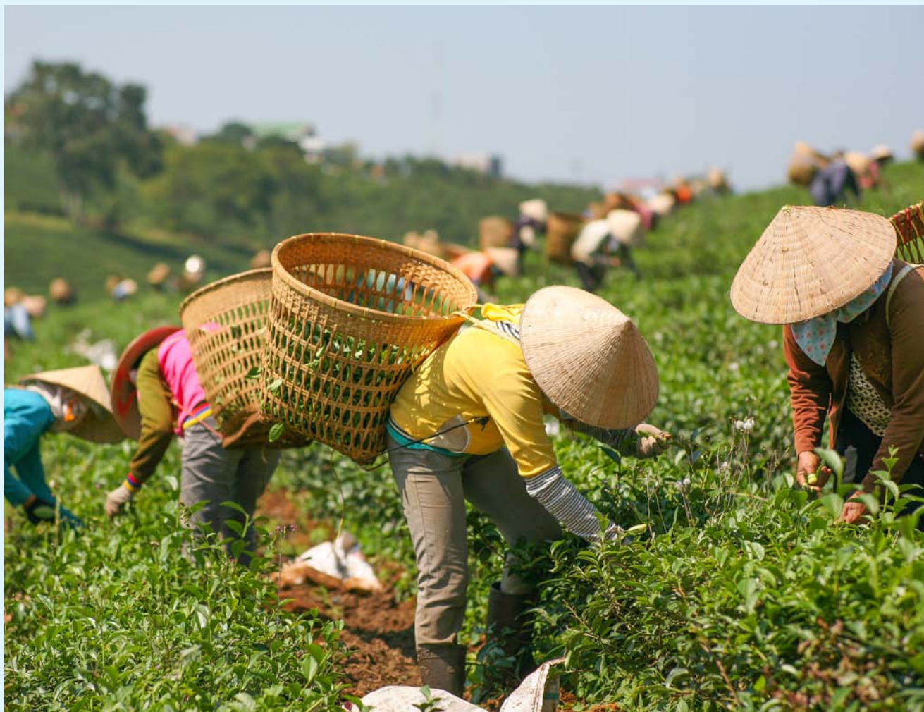
Workers harvesting tea leaf in Bao Loc, Vietnam

Unlike Chad, Vietnam is a country rich in water resources; it is one of the world's highest rainfall countries. The climate thus provides highly favourable conditions for agricultural production in most parts of the country. The government of Vietnam has prioritised agricultural production to achieve food self-sufficiency. In doing so, the government has made significant investments into improving irrigation infrastructure to lengthen growing seasons. Currently, approximately 42% of all agricultural land is irrigated, with the majority of irrigation water and fish protein coming from the Mekong River. Increased pressure being placed on the Mekong River Basin by upstream countries, for example building of dams for energy generation in the middle reaches of the Basin, is likely to have profound impacts on both water flow and fish productivity for Vietnam downstream. Under these circumstances, maintaining food self-sufficiency may become more challenging in the future.