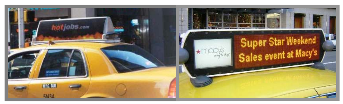
Advertising devices on top of American cabs which do not exactly complement these vehicles visually while the small text might not be beneficial to traffic safety.