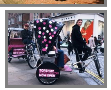
Promogroup's Promocabs (left & top).

Environmental-friendly bicycles such as these can play an important role during the coming 2010 World Cup in overcoming traffic congestions