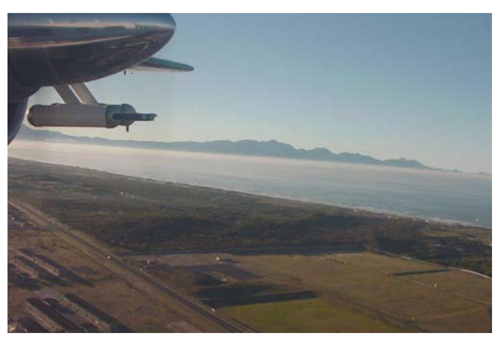
Pollutant concentrations in Cape Town, contributing to the Brown Haze, are measured using instruments fitted to an aeroplane.

were they audited by the calibration laboratories accredited by the South African National Accreditation System (SANAS).