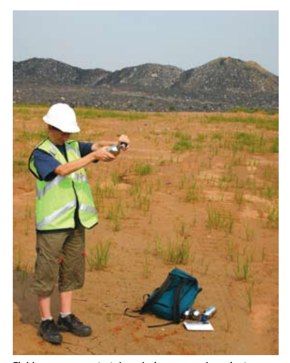
Field measurements taken during research projects provide valuable insight into the state of air.

South Africa's climate is highly variable, both temporally and spatially. Given the expectations of global warming, it is predicted that this variability will be exacerbated by an increase in the frequency and intensity of droughts and floods. This will impact