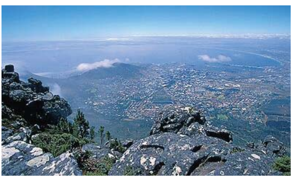
The Cape Town city bowl.

realize emission reduction. In many instances, such regulations have brought high costs and discouraged cost-saving innovations