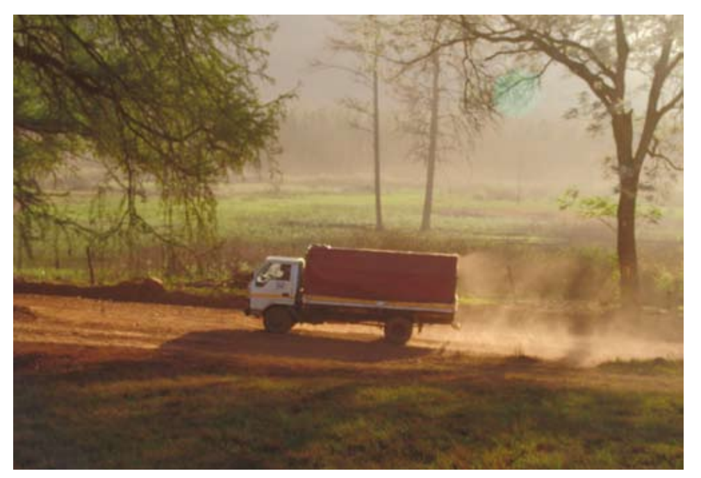
Unpaved roads are a source of vehicle-entrained dust all over South Africa.

Historically, air pollution control in South Africa has primarily emphasized the implementation of 'command and control' measures in the industrial sector. The shift from source-based control, to the management of the air that people breathe, emphasizes the importance of targeting a wider range of sources and using more flexible and varied approaches. It means