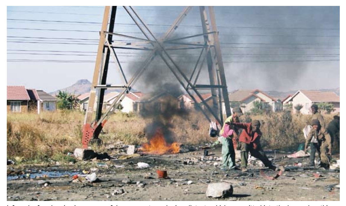
Informal refuse burning is a source of dangerous atmospheric pollutants which are emitted into the human breathing zone.

The geographically dispersed nature of vehicular sources makes it difficult for monitoring and enforcement authorities to target each source, so a mix of technical and non-technical measures is needed. Technological advances progressively reduce emissions from new vehicles through improved vehicle and fuel efficiencies. Internationally, however, such solutions alone have been found inadequate for addressing traffic emissions, and car ownership and the behaviour of users is also a major influence. In South Africa, the problem is aggravated by the fact that public transport is limited. Strategies to reduce vehicle emissions should also include other measures, such as transport demand and supply management, and traffic management, to reduce the incentive for using personal vehicles and to expand and promote the use of the public transport system.