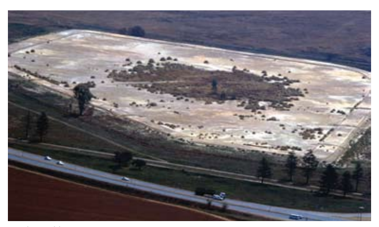
A mine tailings dam along the Johannesburg gold reef.

Where air quality is persistently poor, or deteriorating unavoidably, it is necessary to minimize the burden on those people who are worst affected, through measures such as improvements to the medical system and compensation (using the 'polluter-pays' principle).