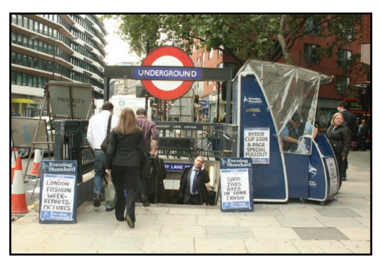
Collapsible newspaper-stand with trolley

The current practice of displaying information on lamp poles should be replaced by a practice of displaying information at central points such as filling stations, community facilities such as libraries and at shopping centres. This implies a paradigm shift, but with a coordinated effort from the various parties involved the accomplishment of such an approach should not be a problem.