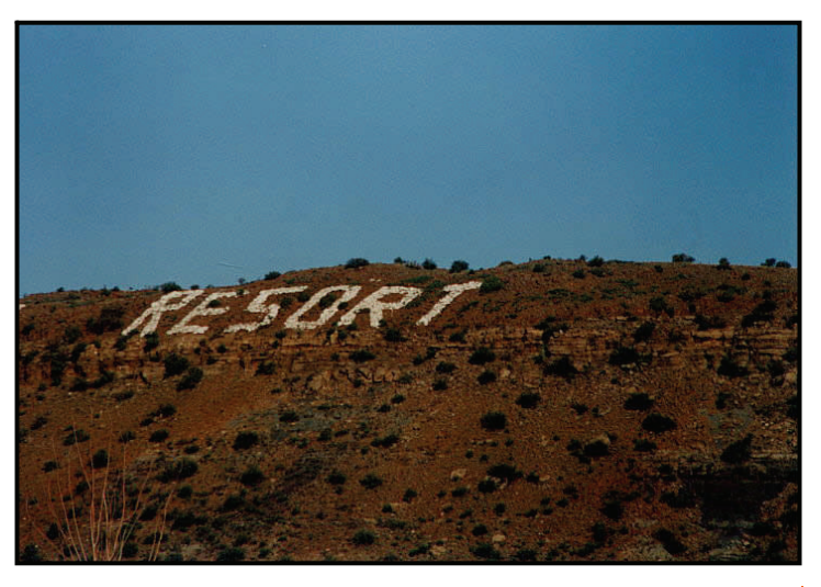
Painted stone signs should not be used for commercial purposes