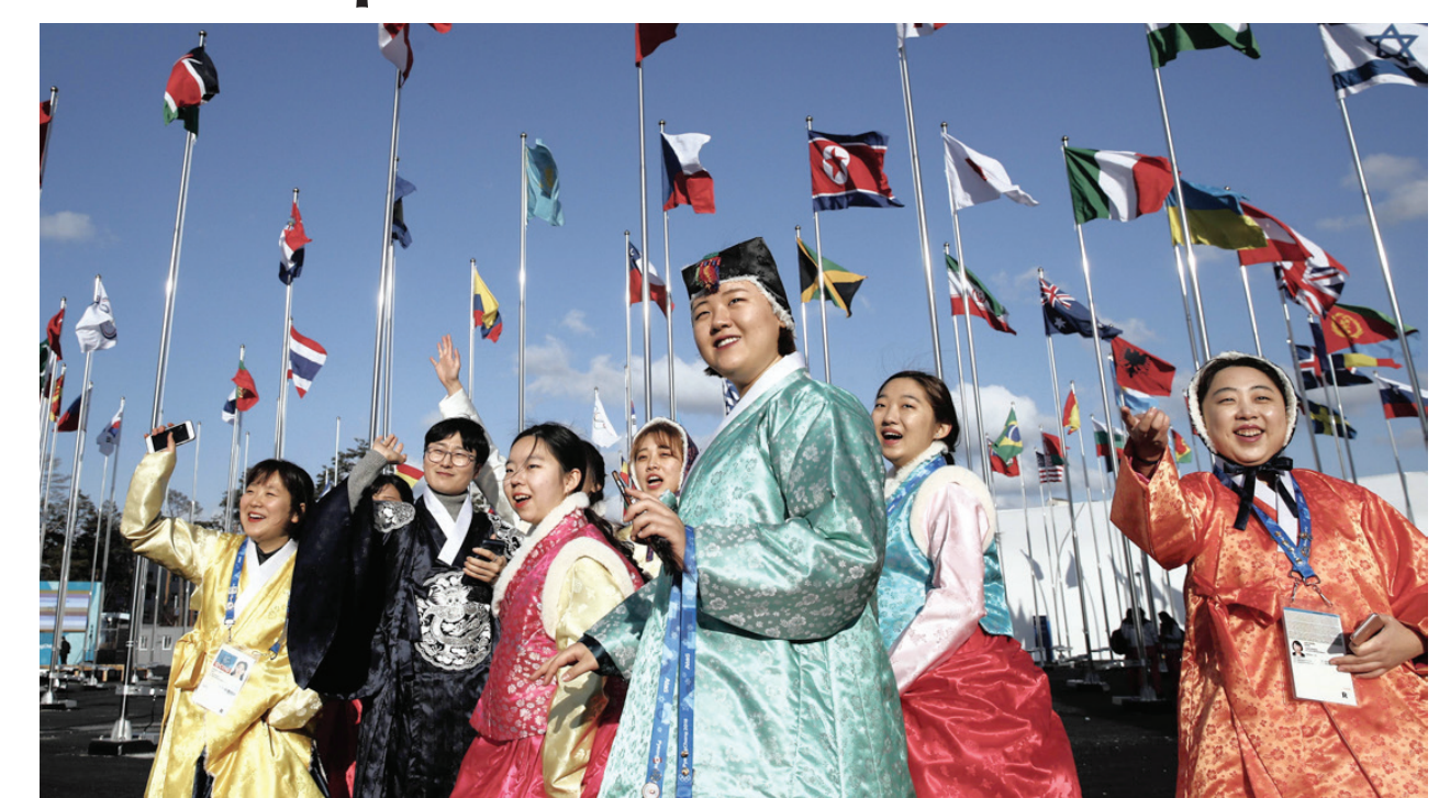
A group of volunteers wearing handbook, Korean traditional dress, yesterday greet athletes entering the Olympic Village as flags, including North Korea's, fly before the 2018 Winter Olympics in Gangneung, South Korea, which starts next Friday. South Korea sees the Olympics as an opportunity to revive meaningful communication with North Korea after a period of animosity and diplomatic stalemate over the North's nuclear and missile programmes.