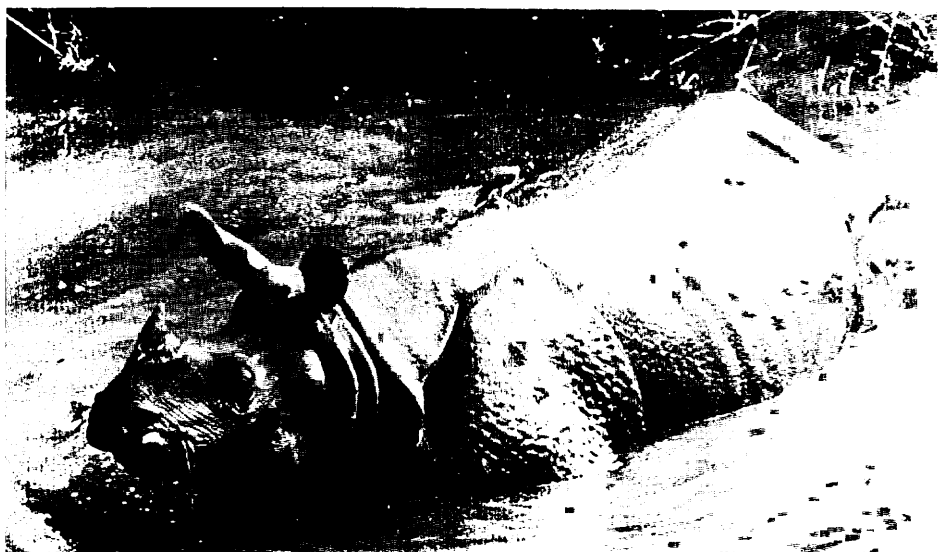
Only about 1,700 Indian rhinos ( Rhinoceros unicornis ) remain in the wild.