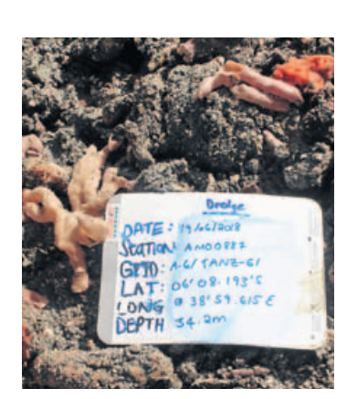
The contents from a Dredge, used to sample the sea floor.

The IIOE2 is a multi-national programme of the Intergovernmental Oceanographic Commission (IOC) which emphasises the need to research