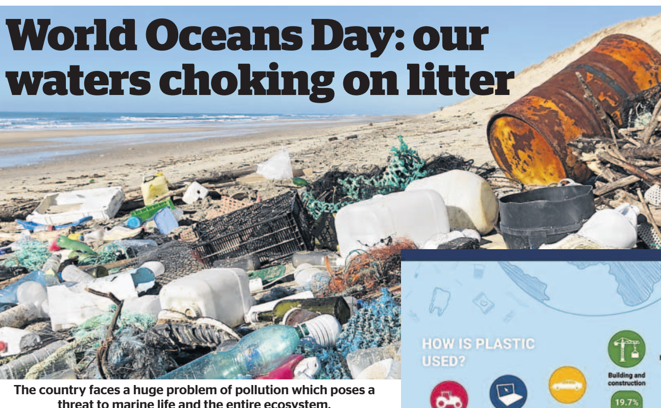
threat to marine life and the entire ecosystem.

problem of marine litter. Plastic products pollute our oceans, endanger marine life and threaten human health. We need to limit the use of plastic in our everyday lives and watch out on how we dispose of it," Molewa said.