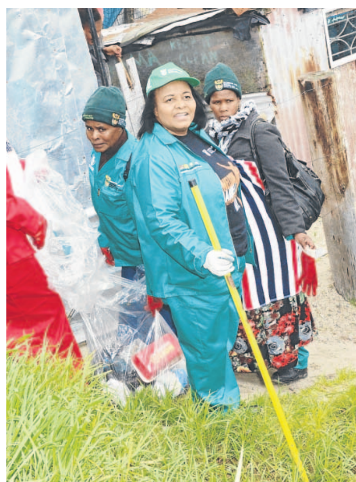
Minister of Environmental Affairs Edna Molewa participates in a clean-up operation as part of a campaign to encourage all South Africans to do their part to combat plastic pollution, including sustainable recycling options.

Molewa urges South Africans to heed President's call in environment sector