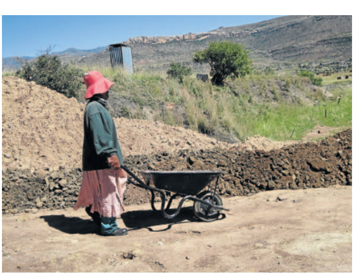
Most rural communities experience challenges brought by severe temperatures and drought.

The World Day to Combat Desertification (WDCD) is an annual celebration aimed at promoting public awareness on desertification, land and degradation and drought sustanainable development (DLDD) and the effects of drought, and a reminder that DLDD can be tackled and solutions are possible.