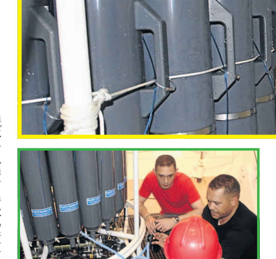
DEA researchers with a North-West University trainee sampling the seawater.

SA has also committed to this very important initiative with research voyages in our own waters of the Indian