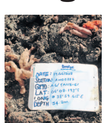
The contents from a Dredge, used to sample the sea floor.

The IIOE2 is a multi-national programme of the Intergovernmental Oceanographic Commission (IOC) which em- ton, biodiversity, large animals phasises the need to research such as whales and seabirds as