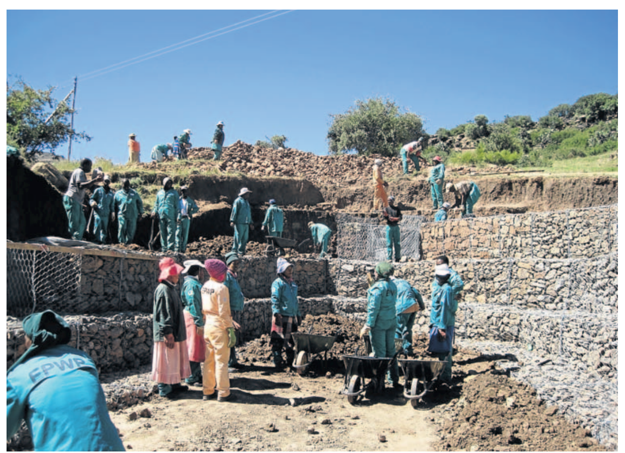
Land care and unemployment amongst poor and unskilled South Africans, are amongst the matters addressed by government's cross-cutting Expanded Public Works Programme

Drought is another negative factor in some of the provinces. But by safeguarding life on land, there is true value on it.