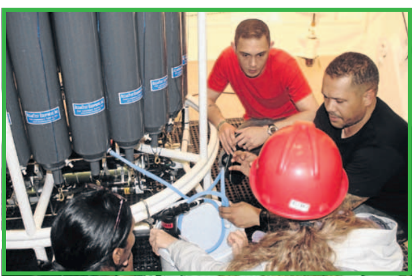
DEA researchers with a North-West University trainee sampling the seawater.