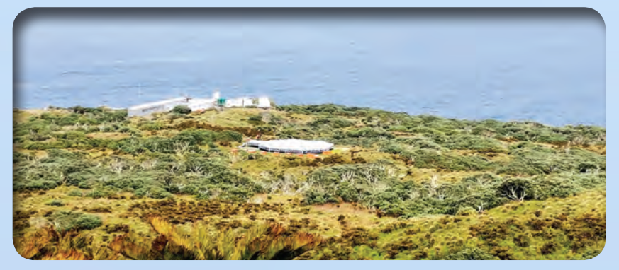
Above: Looking down over pristine Gough Island vegetation towards the heli-deck and the South African Base and beyond that the South Atlantic towards Antarctica.