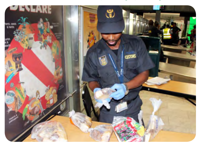
Above: A SARS Customs official inspects confiscated goods from a passenger's luggage at the Cape Town International Airport.

he Department of Environmental Affairs' (DEA) Oceans and Coast Enforcement team, working together with officials from different departments, seized 69 bags of illegal abalone worth over R1 million during a joint search operation initiative called "Bark & Bite" conducted in Cape Town, on 01-02 March 2018.