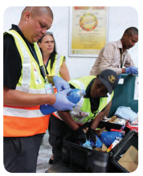
Above: Officials from different departments search the luggage of a passenger.

Some of the activities during the two day operation included harbour aate checks, where members conducted stop and search operations such as tailboard inspections, verification of commodities, documentation verification, stop and searches and detentions. Coastal Patrols were also conducted where rummages, documentation verification,, selected risk cargo examinations and detector dog searches.