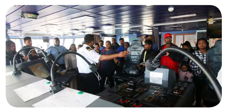
Above: One of the areas visitors get to see during the SA Agulhas II Open is the Bridge, where navigation of the vessel takes place.