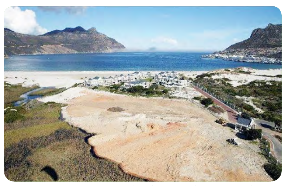
Above: An aerial view showing the recent infilling of the Disa River floodplain as part of the Beach Club housing development.