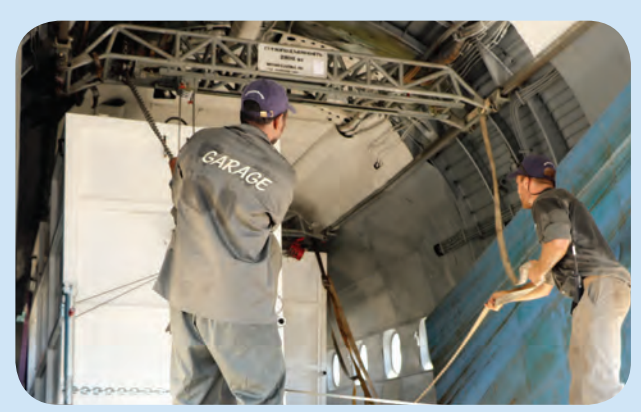
Above: The rhino container was loaded on the plane to Chad.