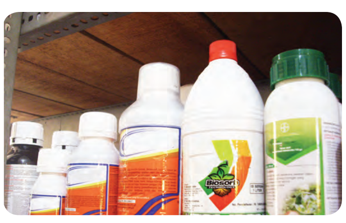
Above: Legally sold pesticides should be in their original container with a label and / or safety information insert on it.