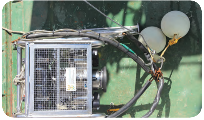
Above: Ski-monkey camera system used by the biodiversity team to conduct a camera tow to gather in-situ footage of the seabed and organisms on the seabed along to Cape Canyon.