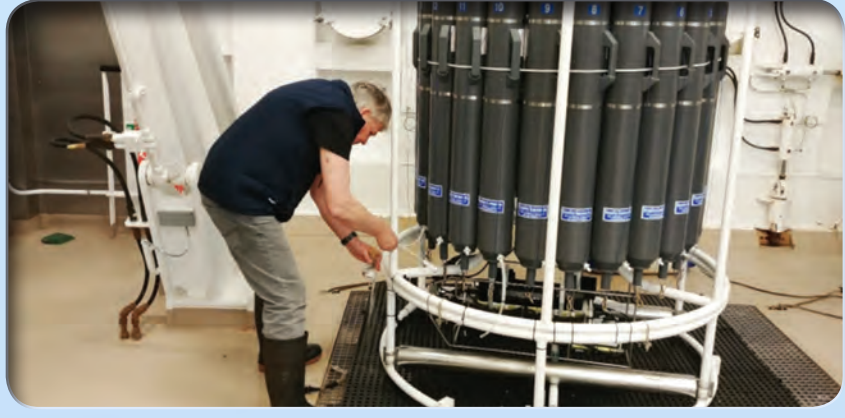
\begin{tabular}{ll} \textbf{Above:} In the wet hydrological laboratory of the SA Agulhas II, taking water samples which measure the oxygen content of the ocean. \end{tabular}