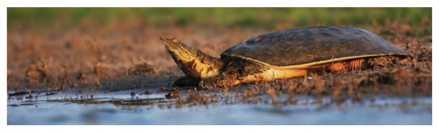
Soft-shell terrapins (Apalone species)

A permit is required to utilise a Category 2 Listed Invasive Reptile Species, in terms of the NATIONAL ENVIRONMENTAL MANAGEMENT BIODIVERSITY ACT, 2004 (ACT NO. 10 OF 2004); ALIEN AND INVASIVE SPECIES REGULATIONS, 2014 (AS AMENDED)