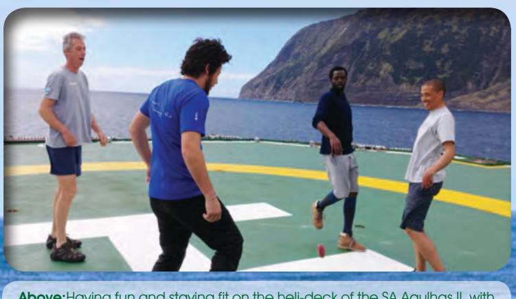
Above: Having fun and staying fit on the heli-deck of the SA Agulhas II, with the coastal cliffs of Tristan da Cunha in the background.