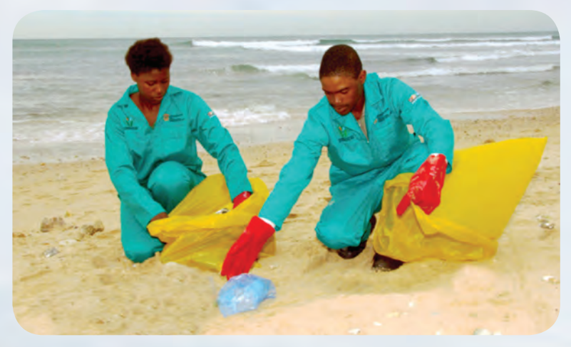
Above: Marine pollution is one of the biggest challenges and it threatens fragile ecosystems. South Africa has a number of measures in place to tackle this problem.

By Zibuse Ndlovu