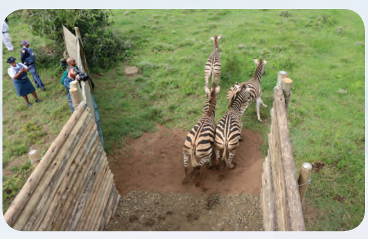
Economy Project on 07 March 2018 in the Eastern Cape. The project emphasizes the need for transformation of the biodiversity economy sector.

dumping. The main purpose of this campaign is to change attitudes and behaviour towards waste - and enable people to take responsibility for keeping their communities clean."