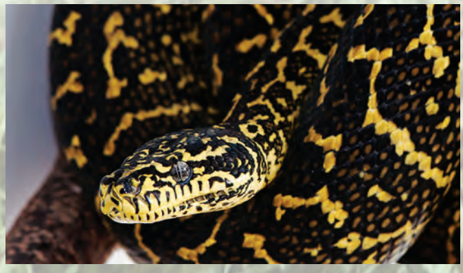
Carpet/diamond Python (Moreila spilota)