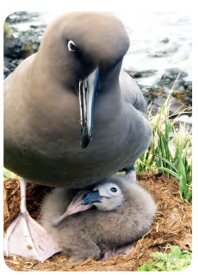
Above: Marion Island Light-Mantled Sooty Albatross.