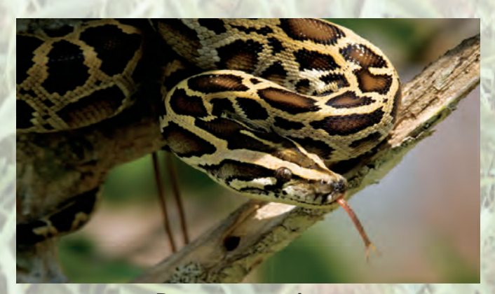
Burmese python (Python bivittatus)

Should you need to conduct any restricted activities involving a Category 2 listed invasive species, please apply for a permit.