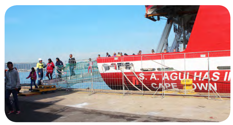
Above: Over 2000 people were hosted aboard the vessel on 08-09 June 2018 and were given the opportunity to explore the ship and the Department's work in the oceans and coastal environment.