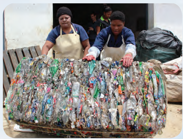
Above: The Minister emphasised that the waste sector remained the most important emerging contributor to the generation of jobs in the green economy.

n line with resolutions taken at the UN General Assembly and UN Environmental Assembly respectively, this year the Department of Environmental Affairs (DEA) has conducted a Plastic Material Study in collaboration with industry, the South African Bureau of Standards (SABS), the National Regulator for Compulsory Specifications (NRCS), the National Treasury and the Department of Health