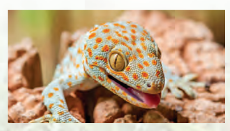
Tokay gecko (Gekko gecko)