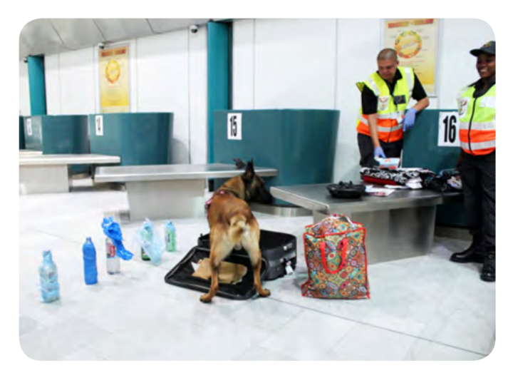
Above: Counterfeit goods and medicines were confiscated during dog searches at the airport.

By Tshego Letshwiti