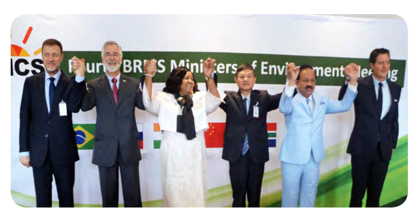
Above: BRICS Ministers of Environment held hands as a symbol of the successful 4th BRICS Ministers of Environment meeting.