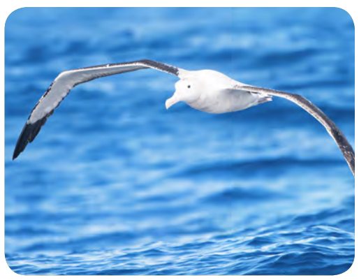
Above: Wandering Albatross.