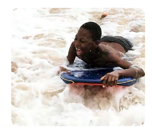
Above: Learners taking in surfing lessons at Sodwana Bay.

swimming lessons focusing on safety in the water and snorkelling and hosted 41 swimmers between the ages of 15-40 years over two days. Participants were invited from the Coast Care Unit of Katanga Services, Katanga Gate Management, Moses Zikhali High School, Mpiyakhe High School, Nhlambanyathi High School, licensed activity operators and Small Steps Surfing Academy. Participants were sponsored swimming gear including costumes, swimming goggles and caps.