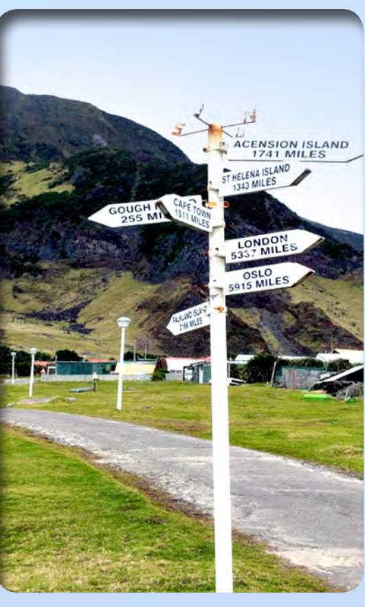
Above: Tristan da Cunha, at more than 1300 miles away from its neighbours, is the world's most isolated human settlement. (Note Gough Island, only 255 miles away, is a manned base, not a settlement).