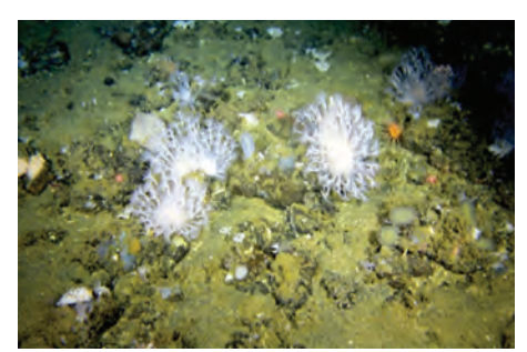
Above: Images showing the diverse habitats and associated benthic communities observed within the different functional units of the Cape Canyon.

he Department of Environmental Affairs (DEA)) Oceans and Coastal Research scientists conducted the final phase of the three-year multi-institutional scientific program on the Cape Canyon on 5-29 March 2018. The Cape Canyon is situated along the Southern Benguela on the West Coast of South Africa. The DEA led collaborative research project was conducted in partnership with the South African Earth Observation Network (SAEON), South African National Biodiversity (SANBI), Council of GeoScience, Nelson Mandela University (NMU), and was the first known multi-disciplinary study on the Cape Canyon.