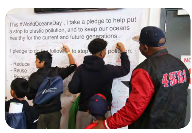
Above: Members of the public sign their pledge to do their bit to stop plastic pollution.

Department's work in the oceans and coastal environment.