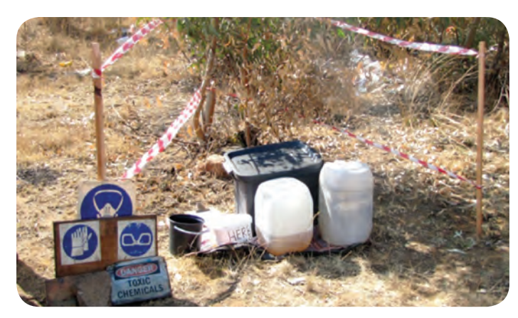
Above: Inadequate absorbent materials used at herbicide storage area.