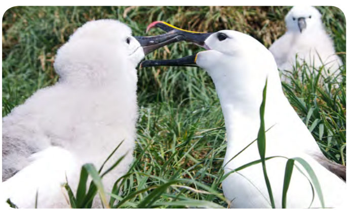
Above: Indian yellow-nosed Albatross.