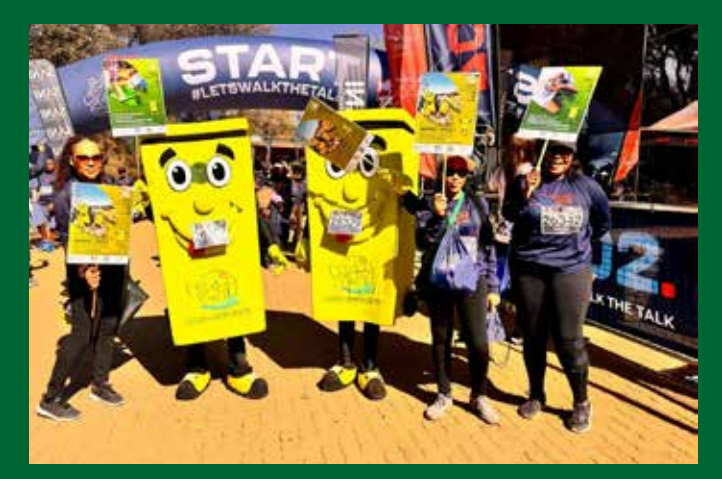
Above: Other team members joined the 6.7KM walk with our famous and most liked mascot Billy Bin to further spread the message of Good Green Deeds.