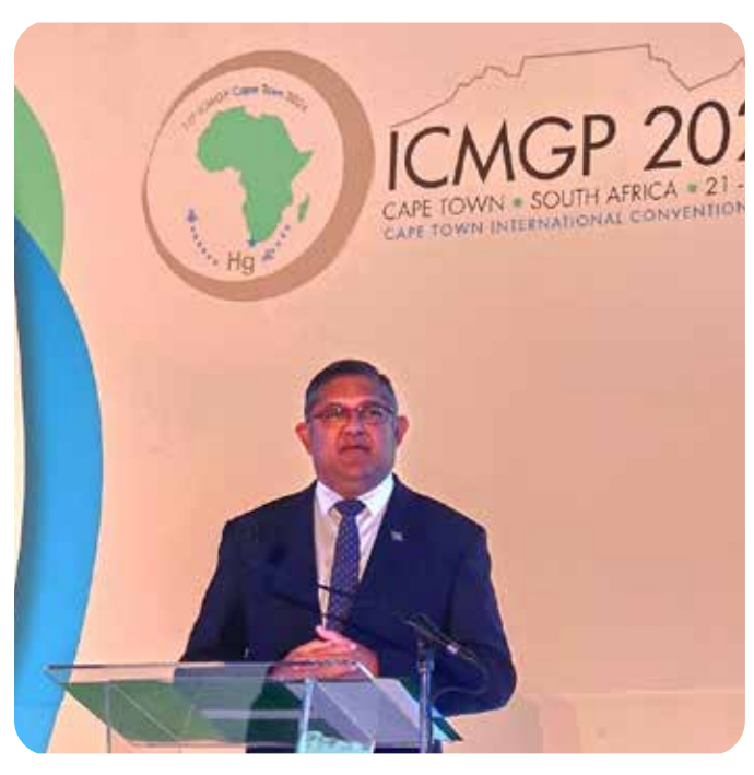
Above: Deputy Minister Singh addressing delegates of the 16^{th} International Conference on Mercury as a Global Pollutant.

outh Africa's Deputy Minister of Forestry, Fisheries, and the Environment (DFFE), Mr. Narend Singh, addressed the 16th International Conference on Mercury as a Global Pollutant, emphasising the nation's critical role in managing mercury emissions. This conference, notable for being the first held on African soil, took place at the International Convention Centre in Cape Town, 21 - 26 July 2024.