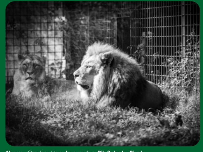
Above: Captive Lion.