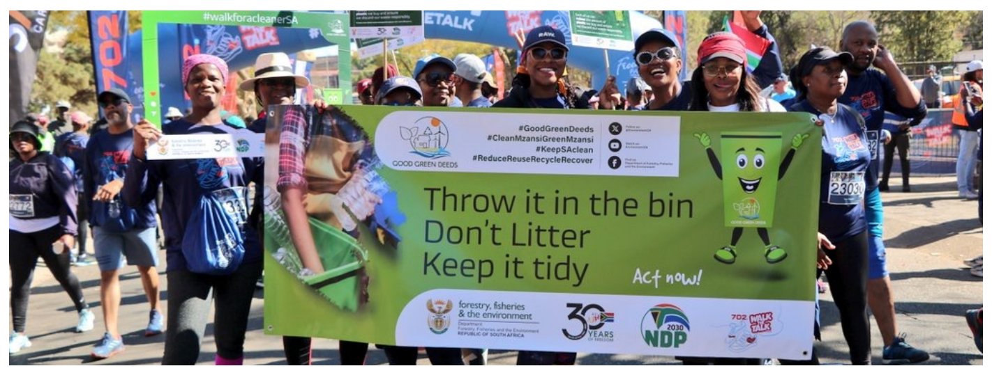
Above: Don't Litter, Throw It In The Bin that was the message of the day.