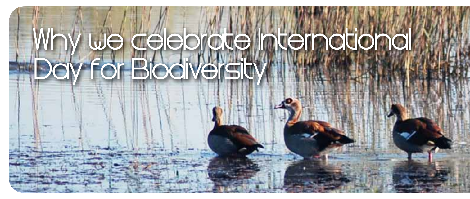
By Veronica Mahlaba; Pamela Kershaw, and Lucia Motaung

hroughout the world people celebrate International Day for Biodiversity (IDB) on 22 May. It was first created by the Second Committee of the United Nations (UN) General Assembly in late 1993, 29 December (the date of entry into force of the Convention of Biological Diversity), was designated the International Day for Biological Diversity.