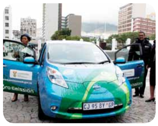
DEA's Zero Emission Car became the centre of attraction in parliament during the exhibition walkabout.

uring the month of June we celebrate World Environment Day, a day that allows us an opportunity to pause and reflect on the work of our sector and how we are able to collaborate with other facets of our society.