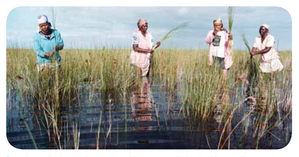
Ecosystems: all native plants, animals and the processes that sustain life on earth

In this context, the mining sector as a business, can contribute hugely to promote the integration of biodiversity into business practices. In response to this call, a number of regions (e.g. European Union) and governments (e.g. Canada, France, Germany and Japan) have set up regional and national business and biodiversity platforms or roundtables. The launch of the Guideline can catalyse the beginning of the establishment of such a platform or roundtable in South Africa.