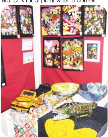
Recycling is one of the effective waste management methods in South Africa.

Development of regulatory framework for appropriate management of chemicals and waste can neither be postponed nor ignored. The department saw it prudent to establish a Chief Directorate that would be a Branch's focal point when it comes