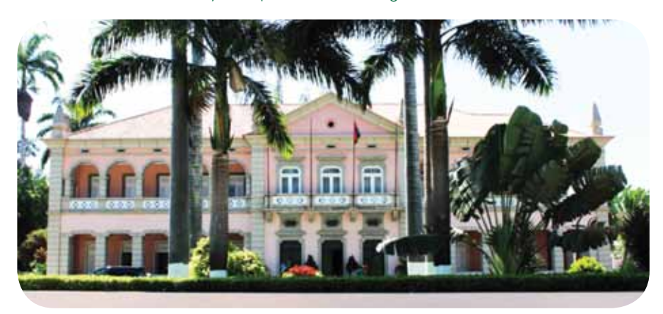
The magnificent, Palácio do Governo de Benguela (seat of the government of the Angolan Province of Benguela), a fitting venue for the historic signing of the Benguela Current Convention.