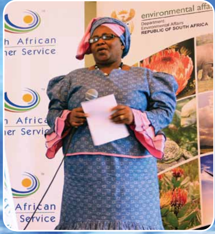
Above: A community leader facilitating the question and answer session during the SAWS Road Show held in Mount Frere, in Eastern Cape.