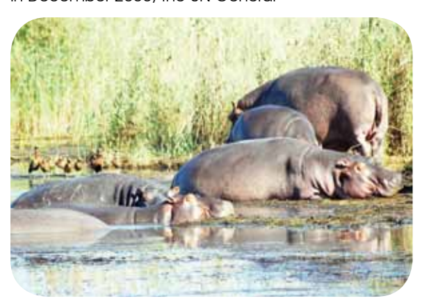
The term ecosystem is defined as a community of living organisms combined with their associated physical environment.

Assembly adopted 22 May as IDB, to commemorate the adoption of the text of the Convention on 22 May 1992 by the Nairobi Final Act of the Conference for the Adoption of the Agreed Text of the Convention on Biological Diversity. This day was proclaimed by the UN to increase understanding and awareness of biodiversity issues. This was partly done because it was difficult for many