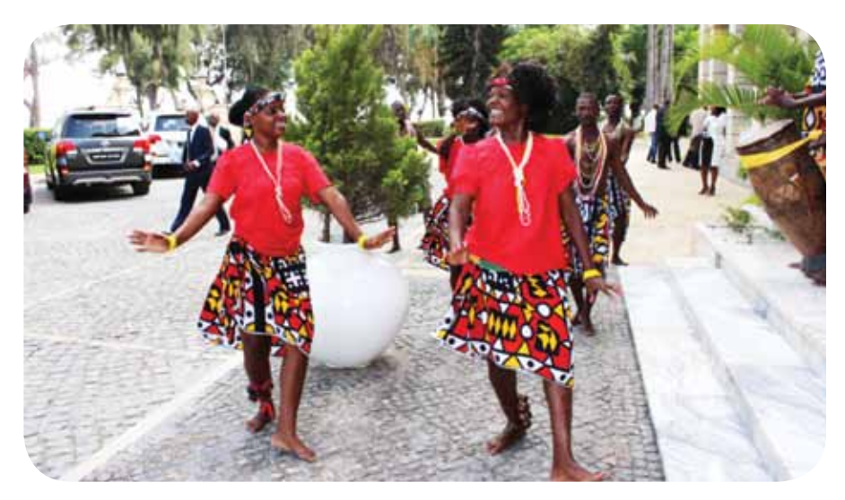
Guests were entertained by a troupe of traditional Angolan dancers.

During the process of ratification, each country will review the text of the Convention, making sure its contents are consistent with national laws and policies. The countries will then present the Convention to their heads of state for signature. The Benguela Current Convention will come into force 30 days after it is ratified by each Party.