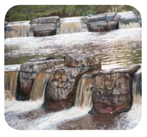
Water is essential for life. No living being on planet Earth can survive without it. It is a prerequisite for human health and wellbeing as well as for the preservation of the environment.

This launch also will serve to adhere to the CBD's call on businesses, governments and other stakeholders to do more to maximize the benefits posed by biodiversity while minimizing