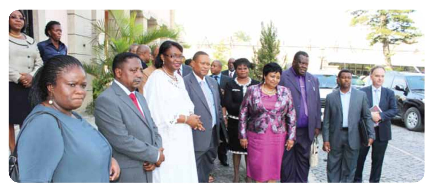
The ministerial delegation arrives at the Palace of the Provincial Government of Benguela for the signing ceremony. The event was attended by a large number of ministers and deputy ministers from Angola, Namibia and South Africa.

had begun to collaborate in the study of the BCLME as early as 1995. With the support of the governments of Norway and Germany, they had established BEN