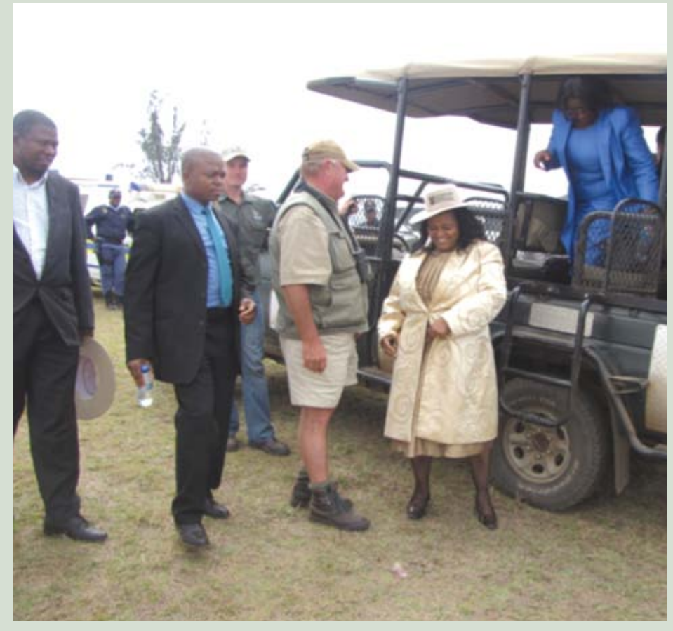
PLEASED: Minister of Environmental Affarirs Edna Molewa arrives at an event after taking a drive through the Somkhanda Game Reserve.

Green Fund boosts project with R22-million