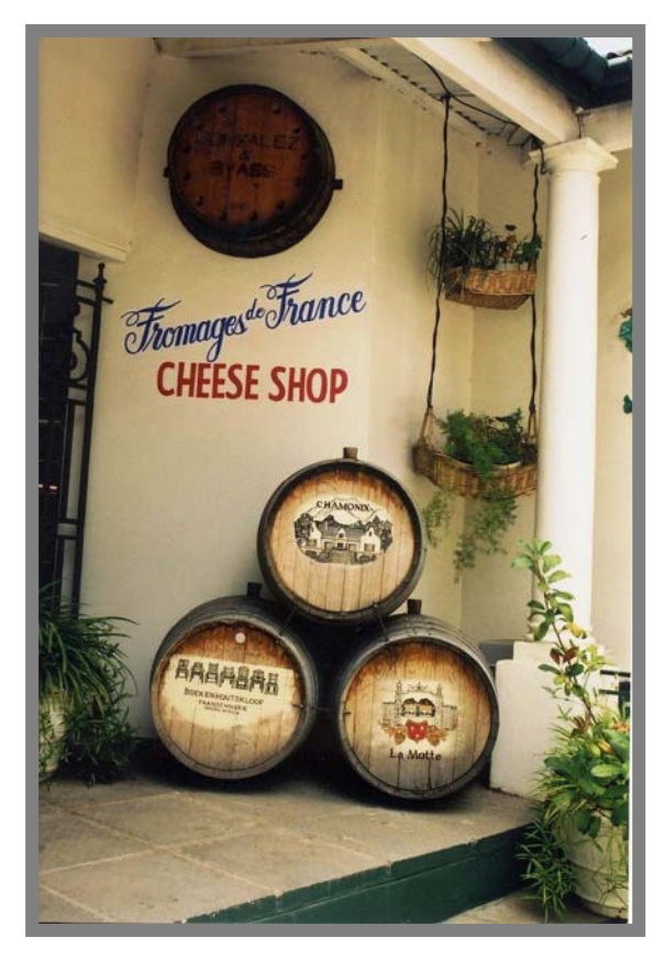
The teddy bear and wine barrels (bottom left and right) both serve to advertise items sold at those shops, also contributing to local character. Both of these 'signs' can be classified as <u>Class 3j ~ Advertisements on</u> forecourts of business premises.