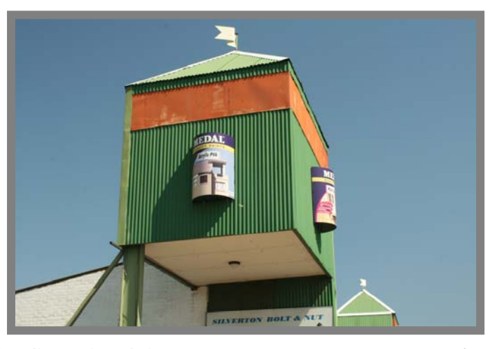
Class 2a ~ Product replicas and 3-dimensional signs

The paint replicas against the walls of a hardware shop (right) can be classified as Class 3c ~ Wall signs.