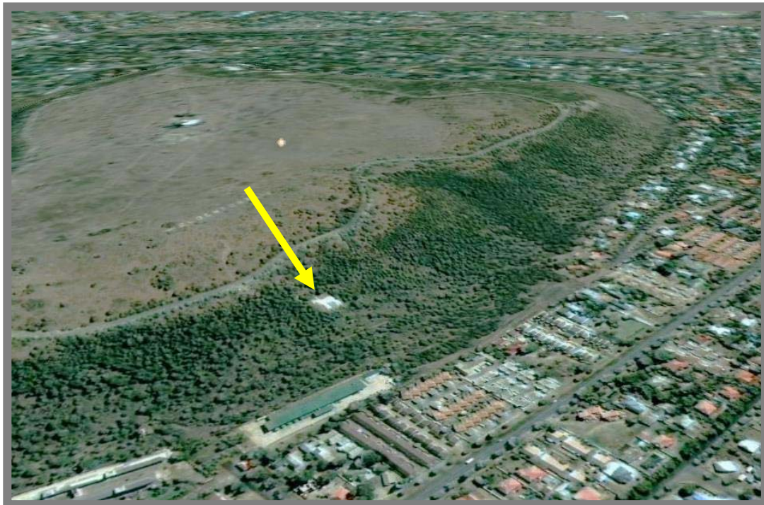
The White Horse on the eastern slope of Naval Hill, Bloemfontein, Free State Province (Top image from Google Earth).

However, this signs type has all the potential of seriously impacting on rural landscapes and on topographical features in urban landscapes. The question should therefore be asked whether the construction of such signs should still be allowed today. If allowed it should definitely be subjected to an EIA or SEA procedure of which a visual impact assessment should be a key ingredient, while no commercial or religious messages should be allowed at all.