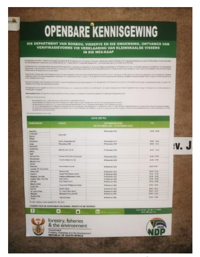
Figure 6-2: Mobilisation for Receipting- Poster at venue