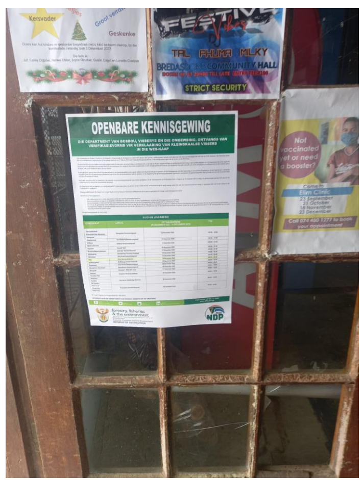
Figure 6-2: Mobilisation for Receipting - Poster at venue