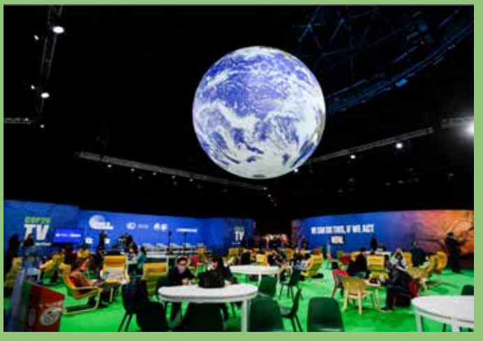
Above : The 26th Conference of Parties to the United Nations Framework Convention on Climate Change (UNFCCC) held in Glasgow, Scotland, on 31 October to 12 November 2021