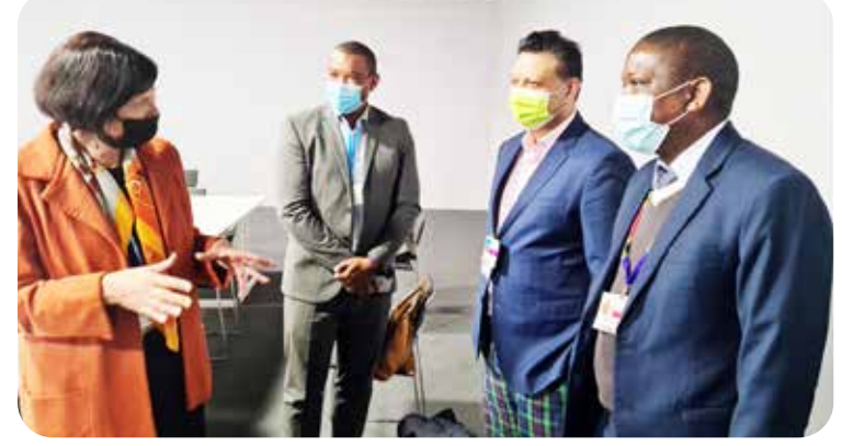
Above : Forestry, Fisheries, and the Environment Minister Barbara Creecy interacting with the South African climate change negotiators ahead of the High-Level Segment week at COP26, in Glasgow.