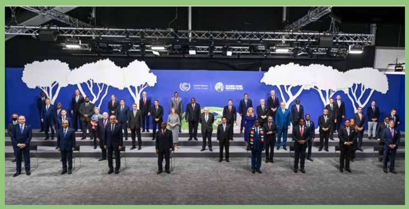
Above: World leaders at COP26 have reaffirmed their commitment to sustainable land use, and to the conservation, protection, sustainable management and restoration of forests, and other terrestrial ecosystems.

he Summit at COP26 announced its first major agreement, where 105 countries covering 85% of the world's forests have committed to act on reducing and reversing deforestation.