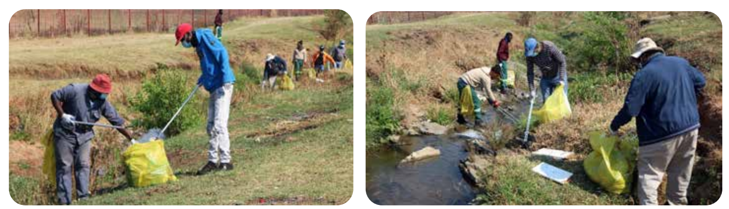
Above: The DFFE officials were joined by Gauteng Department of Agriculture and Rural Development, the City of Tshwane and the JNF Walter Sisulu Environment Centre members as well as community members to clean-up the rubbish along the river.

The Department joined forces with the Gauteng Department of Agriculture and Rural Development, the City of Tshwane and the JNF Walter Sisulu Environment Centre in cleaning a dumping site and along the river Khalambazo, Mamelodi, in Pretoria on 17 September ahead of International Coastal Clean-up Day on 18 September 2021.