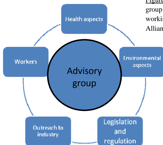
Figure 2: Structure of Advisory group and thematic focal area working groups for the Global Alliance

23. The Global Alliance is not an institutional entity but a collaborative initiative. As such an operational framework has been prepared by UNEP and WHO to describe the working arrangements of the Global Alliance including the role of the advisory group, the five focal area working groups and to provide guidance on public communication, the rights and responsibilities of contributors and guidance on financial matters.