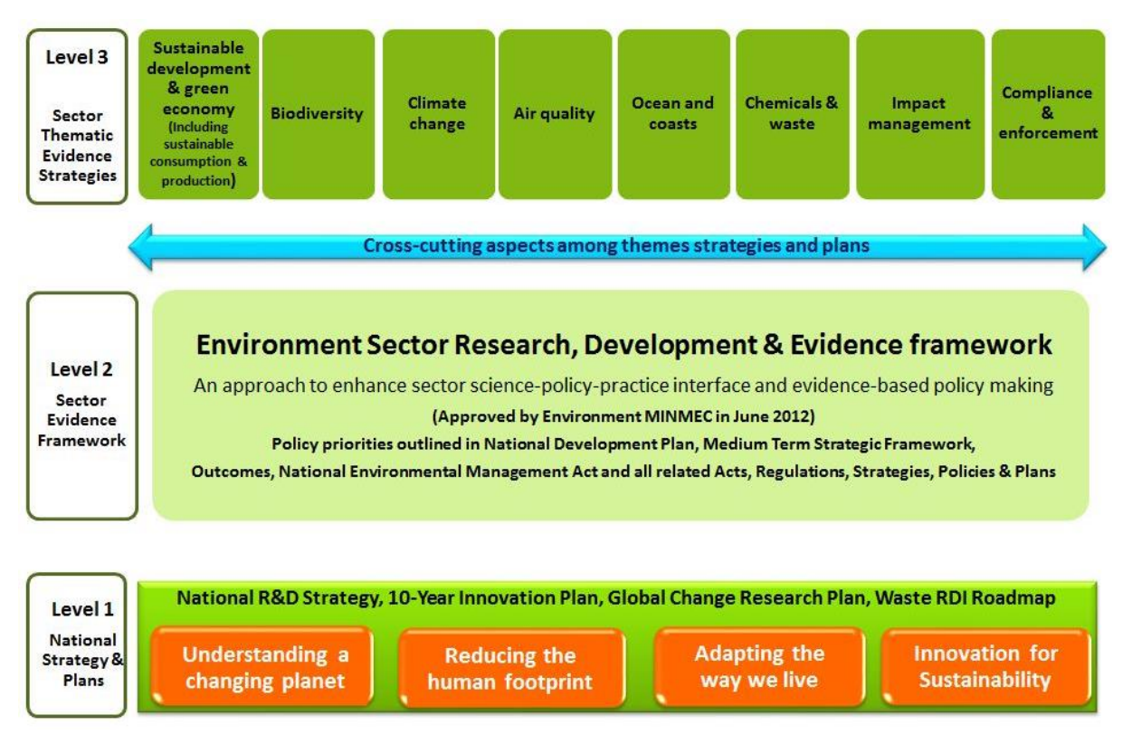
Figure 1: The Environment Sector Research, Development and Evidence Framework

Within South Africa, government has been promoting an evidence based approach to policy development and decision making. The Environment Sector R, D & E Framework outlines three levels of strategy development. The national research agenda is framed by the National Research and Development Strategy, 10- Year Innovation Plan and 10-Year Global Change Research Plan all led by the DST. These are followed by the Environment Sector R, D & E Framework, which was approved by MINMEC on 08 June 2012 which zooms into sector specific policy evidence needs context. This provides a common framework for the collection of evidence that can be used in support of environmental sector policy decisions and for the achievement of sector priorities as outlined in Outcome 10 of government's delivery agreement, the Environmental Sector Plan and the South African Environment Outlook Report. The Environment Sector R, D & E framework identifies eight thematic strategies comprising: sustainable development and green economy (including sustainable consumption and production), biodiversity, climate change, air quality, ocean and coasts, chemical and waste, impact management and compliance and enforcement. Thematic strategies, such as this National Biodiversity R & E Strategy must be developed under each specific theme.