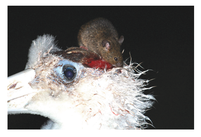
Fig. 4 A Wandering albatross chick being scalped by a mouse on Marion Island in the winter of 2015.

populations. Given the island's importance as a breeding site for threatened albatrosses and other seabird species that are being killed by mice, there is an urgent need to eradicate mice from the island. A detailed feasibility plan (Parkes, 2016) suggests that mice can be eradicated using aerial baiting. This follows the now well-established approach of using helicopters fitted with GPS guidance systems and under slung bait-distribution buckets to spread brodifacoum-laced pellets across the entire island over a relatively short period, to ensure that all rodents have access to the poison bait. Such operations, pioneered on New Zealand's offshore islands, have a good track record in recent years with 21 of 22 operations around the world targeting mice being successful in the last decade (DIISE, 2015). However, the operation on Marion Island will be an order of magnitude larger than any previous island eradication targeting mice only (cf. Springer, 2016; Martin & Richardson, 2017). This will require the deployment of poison bait with a high level of accuracy given the small home ranges of mice relative to rats (Parkes, 2016).