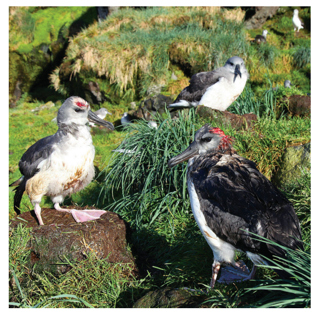
Fig. 3 Grey-headed albatross chicks showing distinctive 'scalping' wounds inflicted by mice on Marion Island in 2015.

Predation by mice is the most likely explanation for the limited recovery of Marion's petrel populations (Dilley, et al., 2016b). Recent evidence from breeding success studies shows that mice are suppressing the recovery of burrowing petrel populations, especially those that breed in winter, through predation on eggs and chicks (Dilley, et al., 2018). Winter breeders had lower breeding success than did summer breeders, with most fatalities being of small chicks <14 days old. Mice were filmed attacking and killing chicks of two winter-breeding species: