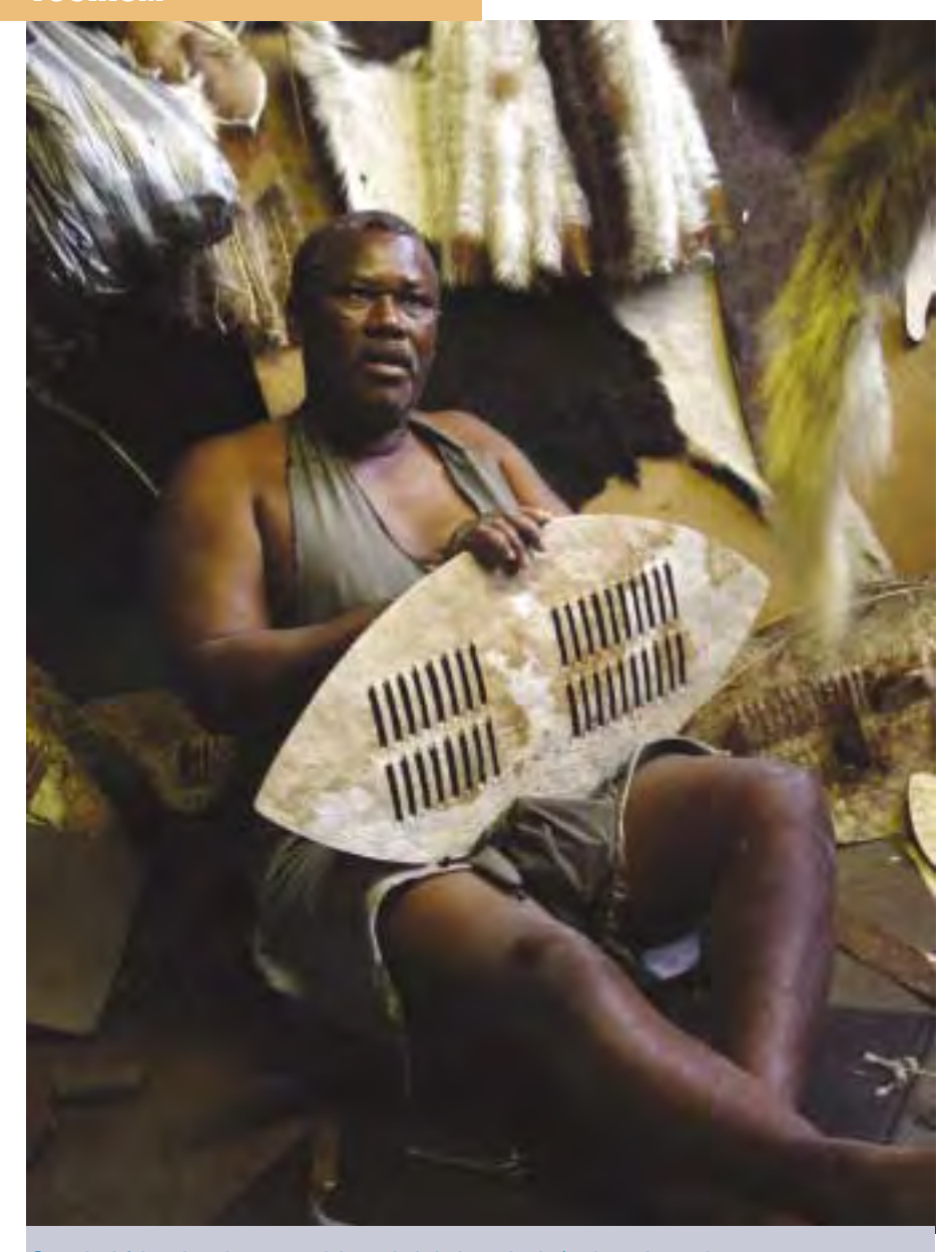
South Africa is also considered rich in ethnic/cultural tourism resources