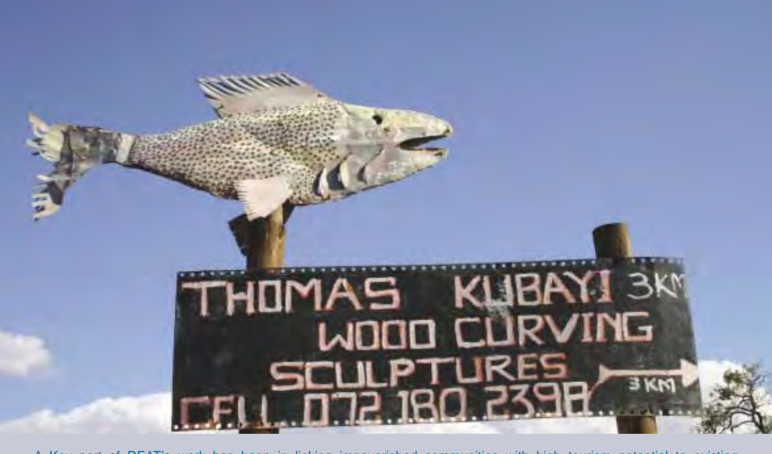
A Key part of DEAT's work has been in linking impoverished communities with high tourism potential to existing infrastructure and attractions.

These grants may be used to fund buildings, furniture, equipment or tourism vehicles.