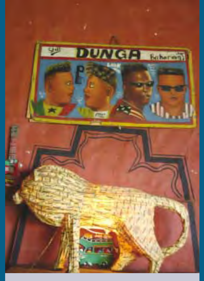
South African crafts and décor are now in demand all over the world.

substantial amounts of foreign currency, while creating SMMEs, black economic empowerment and employment. Many of these products also have an overseas market. They include traditional and modern African arts craft. leatherwork, paintings or sketches, weaving and knitting, pottery, glass and ceramics, jewellery and woodcarving. DEAT is working closely with the TEP, the Departments of Arts and Culture, Trade and Industry, and other organisations develop and strengthen this sector.