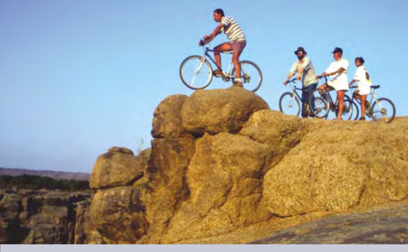
South Africa has managed to achieve relatively high levels of community involvement in nature tourism

assistance and undertake joint marketing activities. Through international tourism relations, South Africa plays its role within the community of nations in promoting growth and development through tourism.