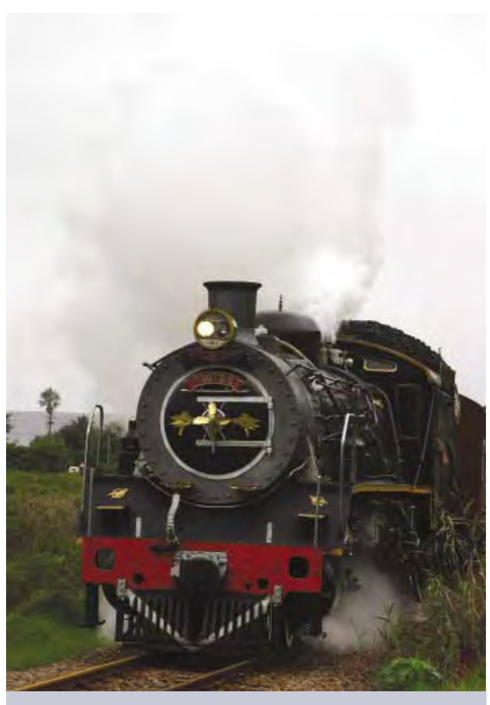
South Africa provides various affordable and comfortable transport options

SATI, was established in 2001 with funds from the Spanish Government. Following a request