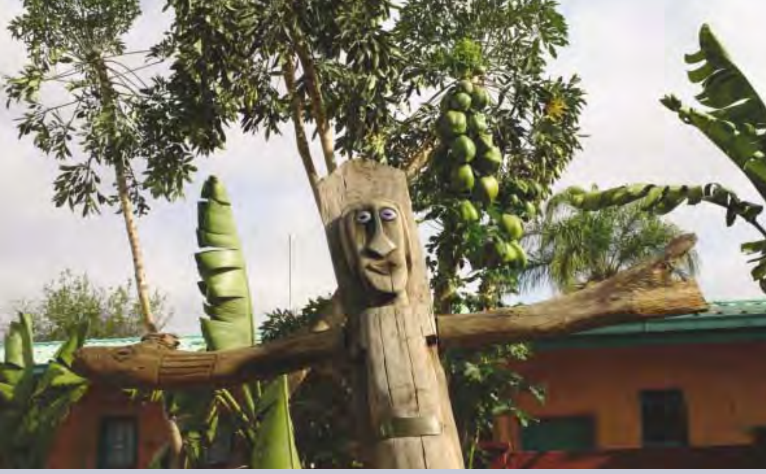
Arts and crafts are often relegated to the informal sector of the economy, yet they can generate substantial amounts of foreign currency, while creating SMMEs, black economic empowerment and self-employment for many of the country's citizens.

assisted by TEP increased from 270 to 579. The value of transactions increased from R37 million to R463 million. The number of jobs created rose from 1 876 to 5 728. The number of transactions increased from 190 to 463 of which 357 were enterprises owned by historically disadvantaged individuals.