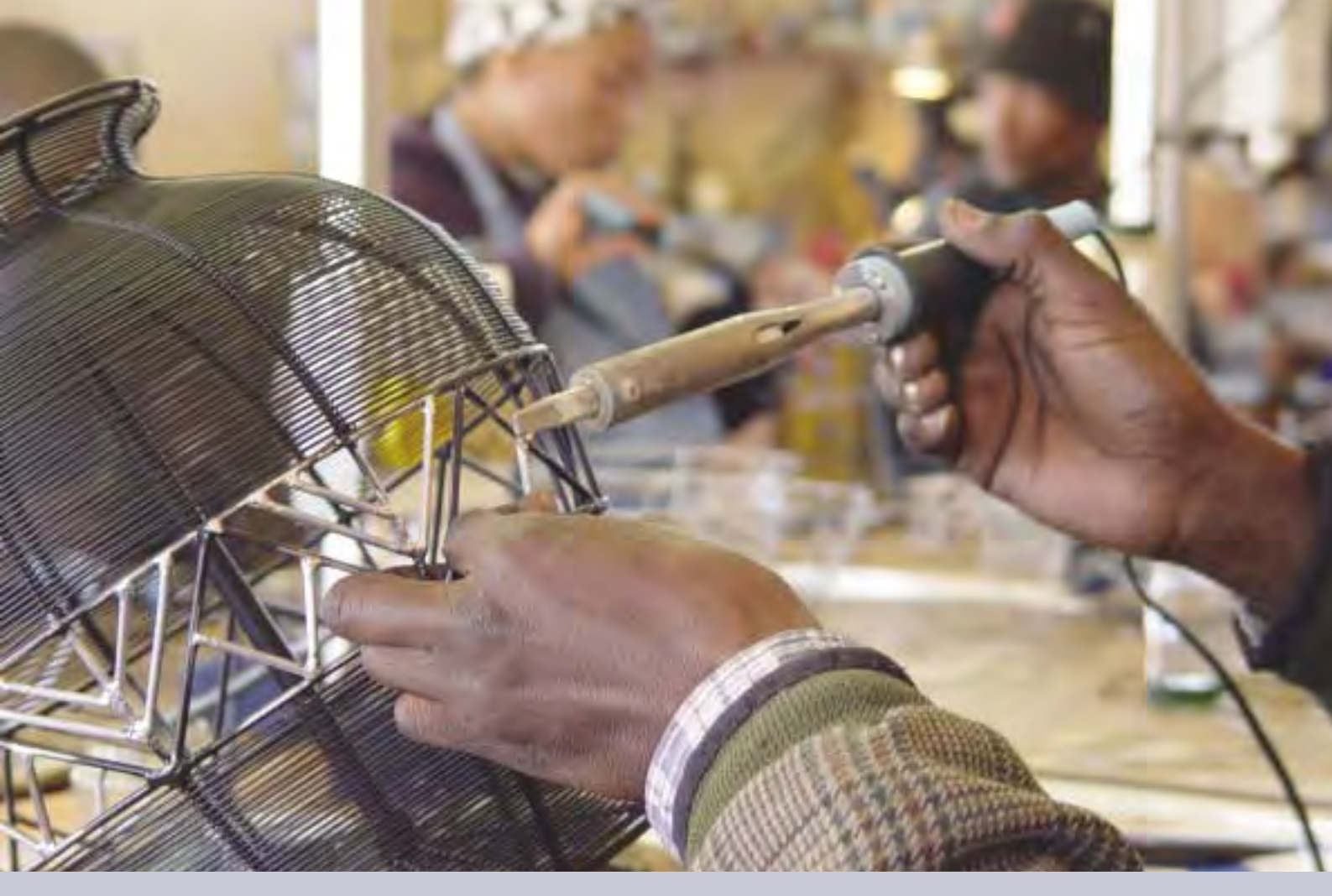
A key objective for Government has been to integrate historically disadvantaged communities into the mainstream of the tourism economy.

tourism industry to fluctuations in international demand, particularly given that international tourism can be extremely sensitive to global political and economic factors.