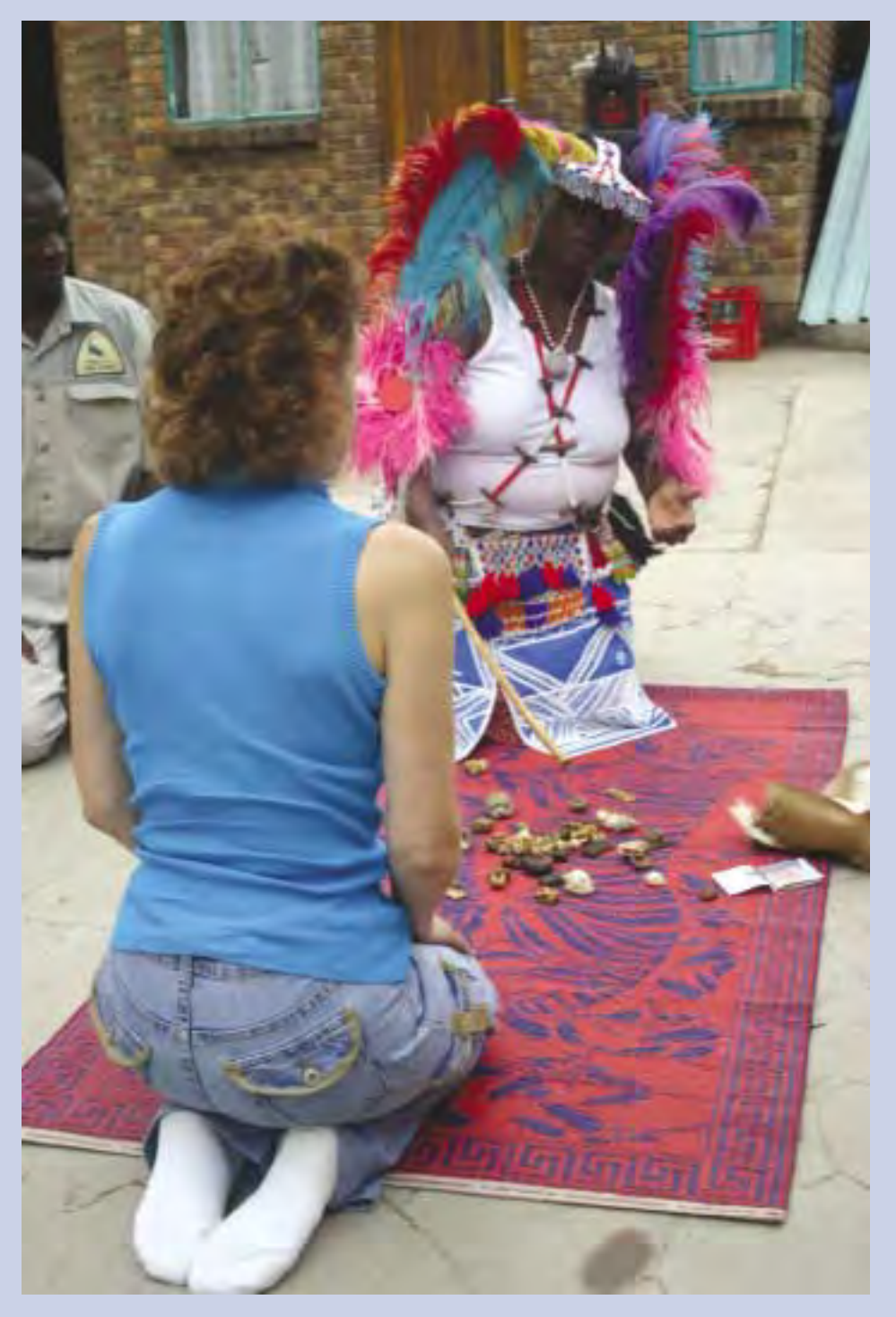
Cultural tourism is one of South Africa's strengths.