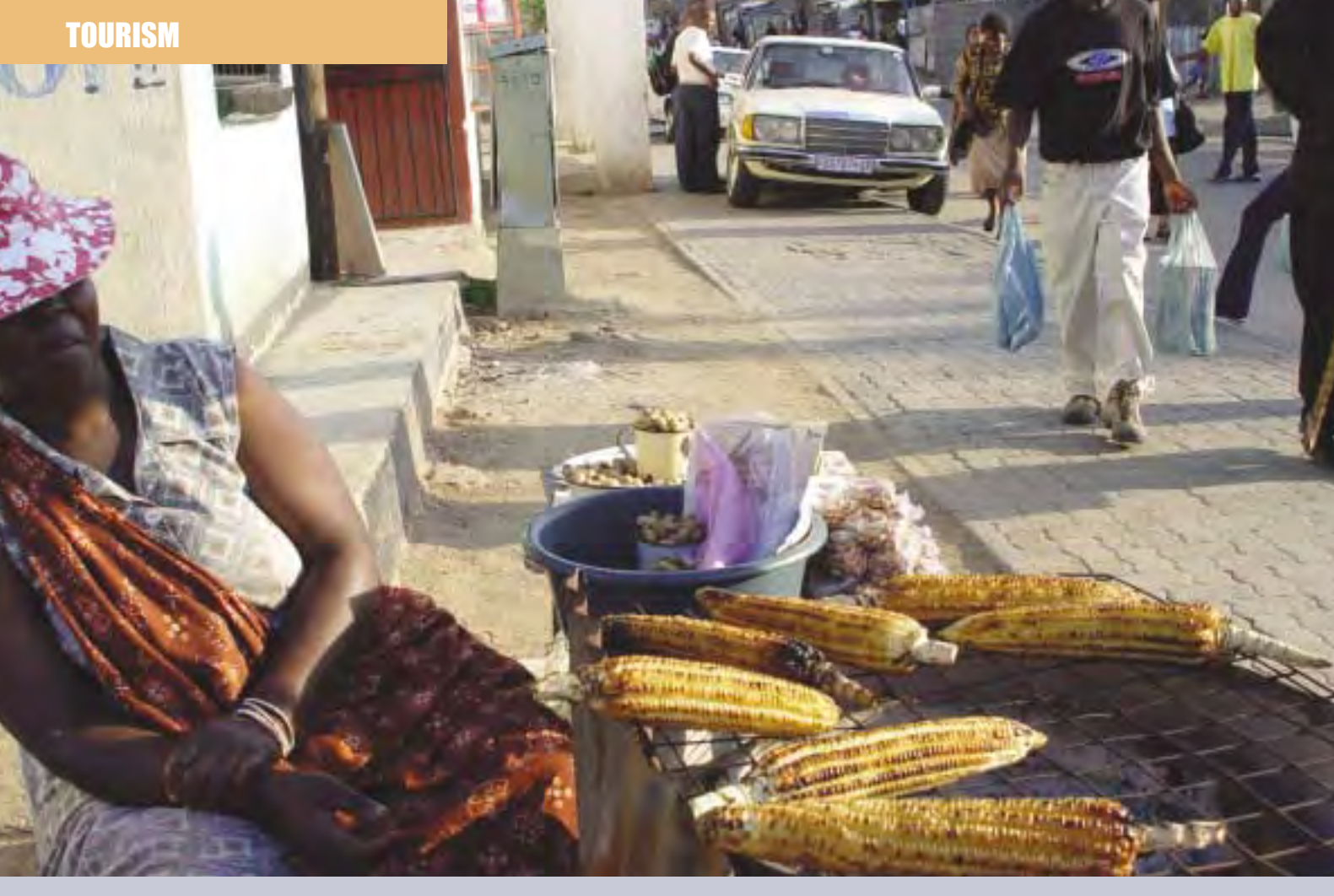
Tourism was identified as one of the country's key industries because of its massive potential to create new jobs and generate foreign income.

A priority in this regard is the development of South-South cooperation between India, Brazil and South Africa (IBSA). Over the past year, a trilateral commission to improve relations between the three countries has been established. Tourism is one of the areas for cooperation kev identified in the IBSA process. In this regard, a Plan of Action will be implemented over the next few years.