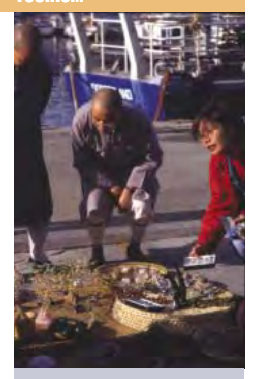
Tourism generates a significant part of the country's GDP.